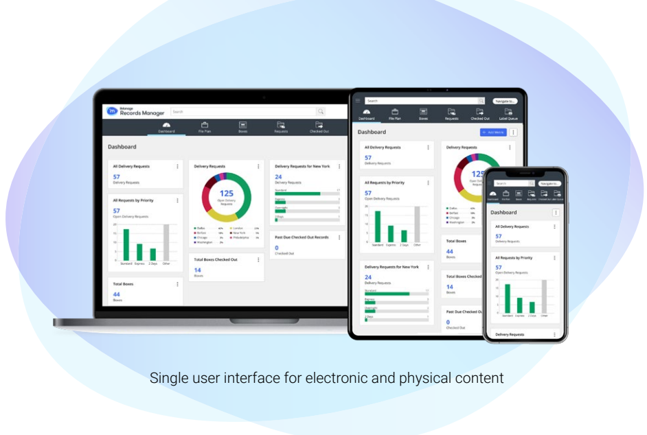
Single user interface for electronic and physical content

buildings, offices, file rooms, zones, racks, shelves, and other specific locations